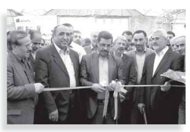
Opening Celebration by attending of deputy of ministry of jihad-e-agriculture; The general manager of Alborz province; Head of this organization in this province