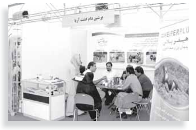
Pershian - Dam - Kesht - e - Aria`s hall presenting the latest technology of genetics from America