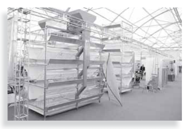
Modern 6 - floors in poultry farms, designed by Saba - Sanaat - e - pershia in Iran